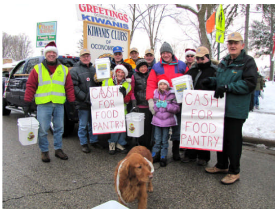
Intrepid Breakfast Club and Rotary members collect over $600 and 12 boxes of food for the Oconomowoc Food Pantry during the annual Christmas Parade in early December.