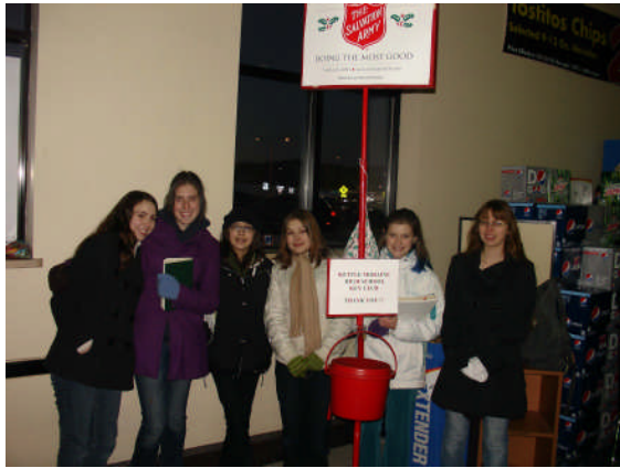
Key Club members from Kettle Moraine High School collect for the Salvation Army and charm shoppers at Pick 'n Save on Hwy 83 by singing holiday songs from 3:00 to 5:30 PM.