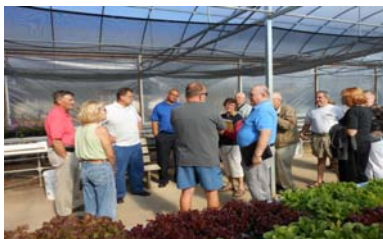
The Club’s June 6 visit to Oconomowoc Development Training Center.