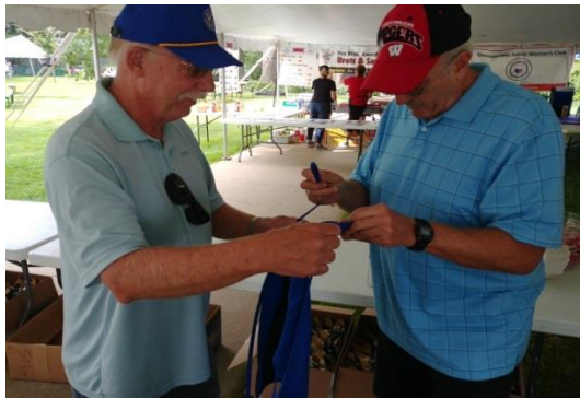
MEN AT WORK ????